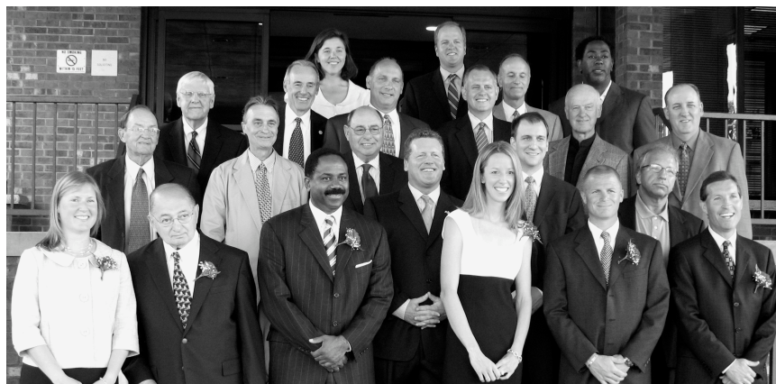
The Hall of Fame Class of 2009 is joined by returning inductees prior to the banquet.

Thanks to everyone who attended. We hope to see you all back next year.